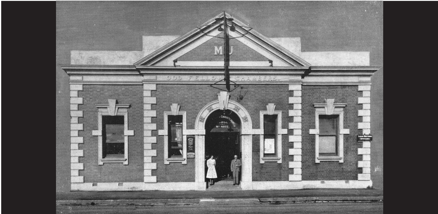
The Manchester Unity Lodge Hall, circa 1904.

And now, 168 St Asaph Street is part of the delicious history of Cafe Valentino!